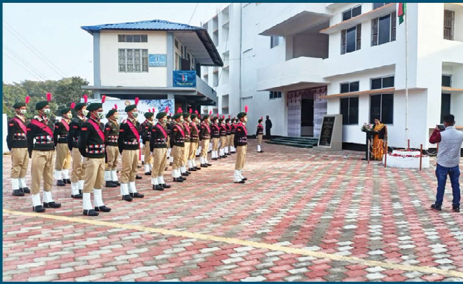
Celebration of Republic Day, 26 th January 2022