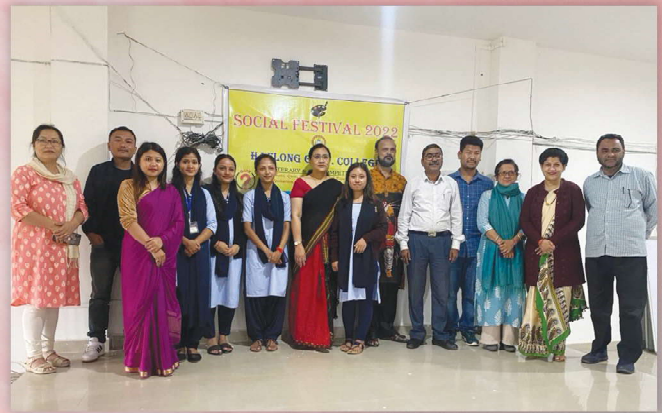
Social Festival, 2022