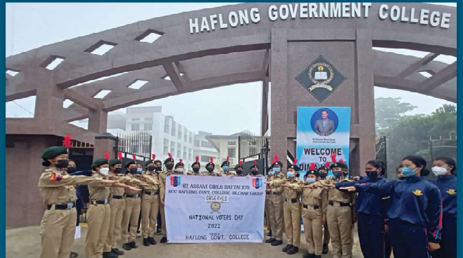
Taking Pledge on National Voters Day, 2022