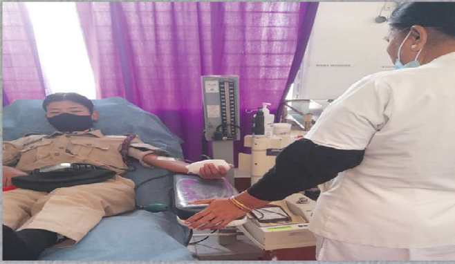
To commemorate National Youth Day our Girls cadets donated blood at Blood Bank of Haflong Civil Hospital, Haflong