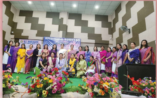
International Women's Day, 8 th March, 2022