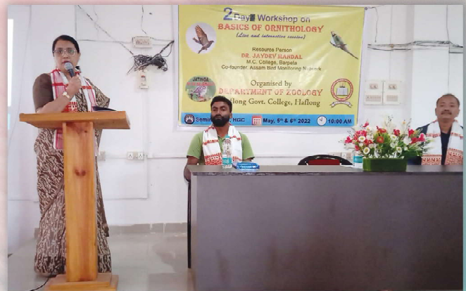
2 Day Workshop on Basics of Ornithology, 5 th & 6 th May, 2022