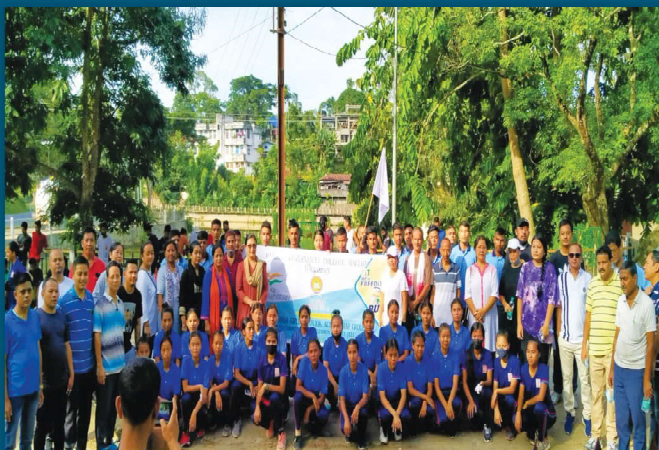
'Fit India Run' Celebration of Azadi kaa Amrit Mahotsav