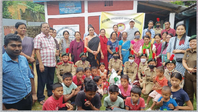
'Distribution of relief goods to the landslide affected people' by HGC family