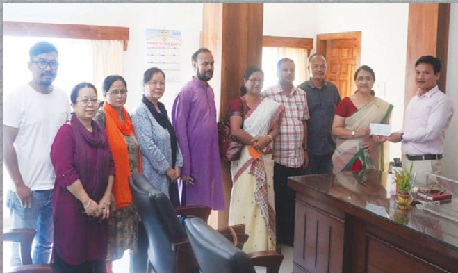
Donation for CEM's Relief Fund by HGC Fraternity