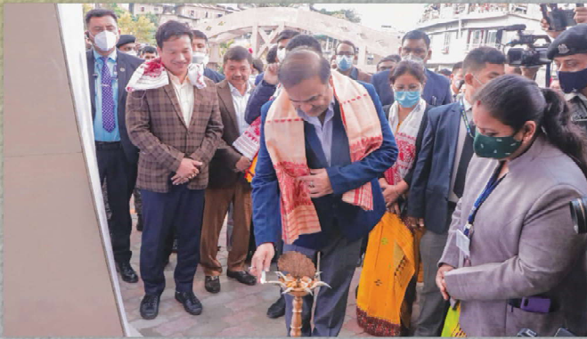
Inauguration of Arts Building of HGC by Hon'ble CM of Assam Dr. Himanta Biswa Sarma