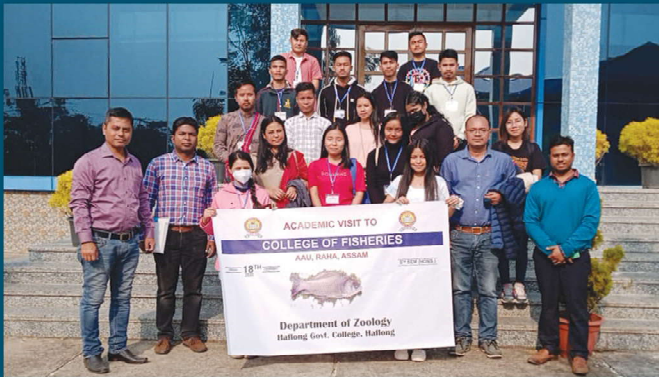
Academic Visit to College of Fisheries, AAU, RAHA, Assam, 2022, Department of Zoology