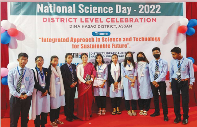
Observation of National Science Day - 2022