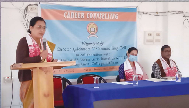
One Day Workshop on Career Counselling