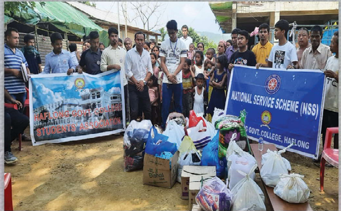
'Relief distribution to the landslide affected people' by NSS & HGCSA