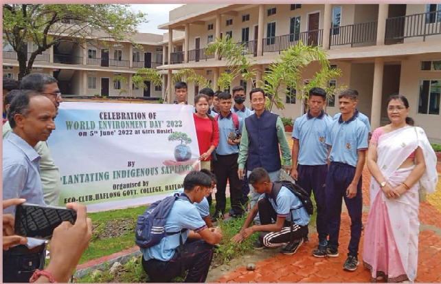
Celebration of World Environment Day, 5 th June, 2022