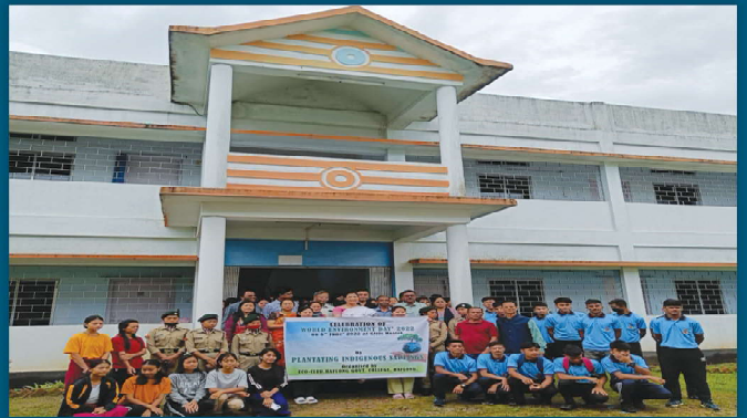
Plantation Programme at HGC Girl's Hostel