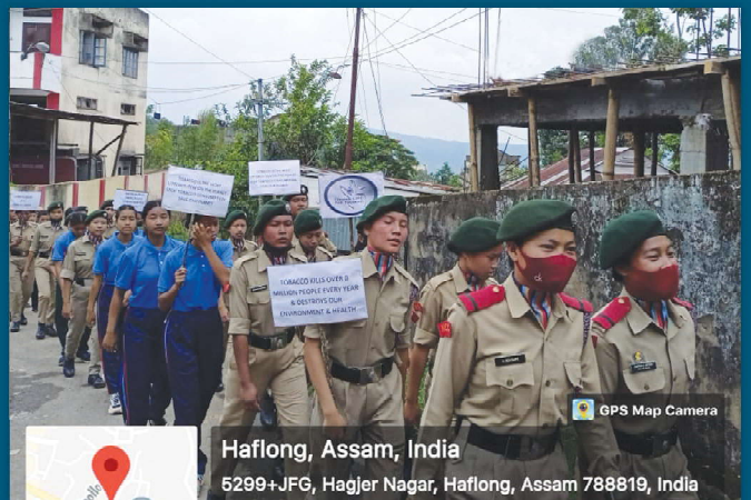
No Tobacco Day observed by NCC Girl's