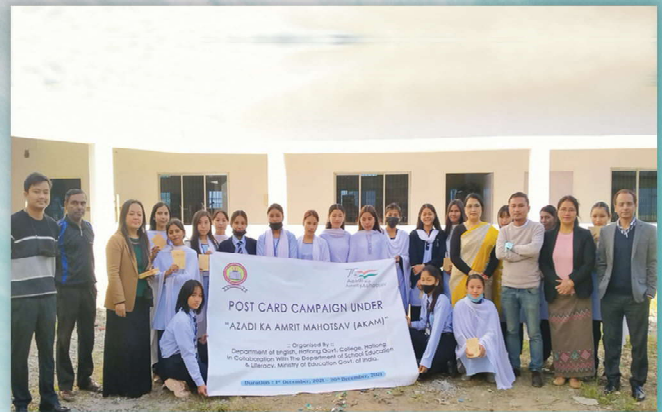
Post Card Campaign under 'Azadi ka Amrit Mahotsav (AKAM)' 1 st to 20 th Dec. 2021