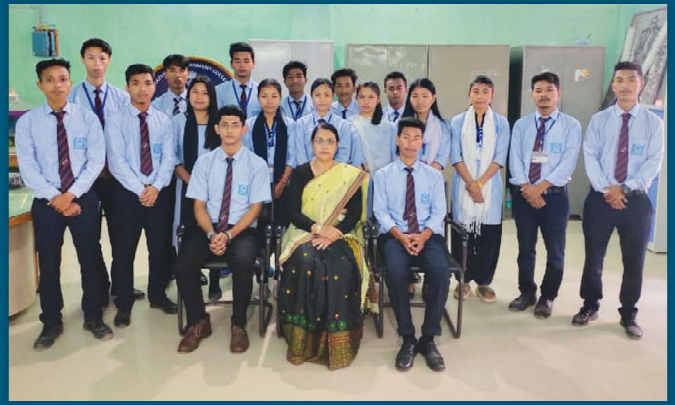
Haflong Govt. College Students Association