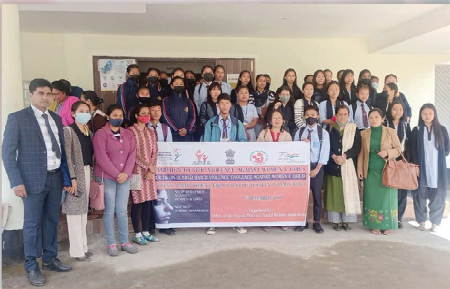
'Campaign to Stop Violence Against Women and Girls' rally Orgd. by Office of the Deputy Commissioner, Social Welfare Dept. Dima Hasao