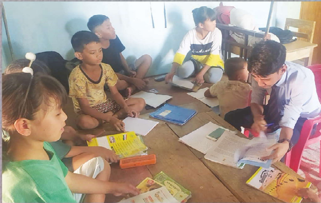
Teaching the Children of 'Hosanna Orphan Home' by the NSS volunteers of HGC