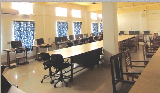
Digital Library Reading Room