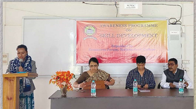
Awareness Programme on Skill Development