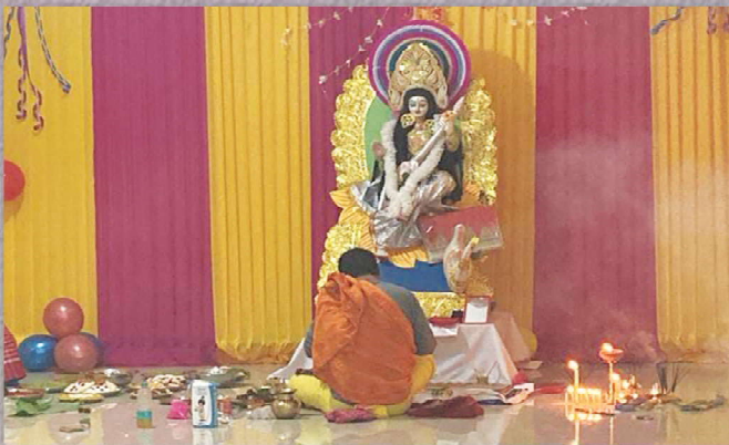
Celebration of 'Saraswati Puja'