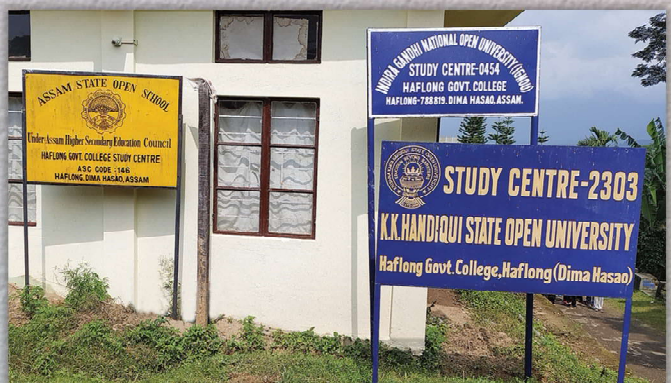
Distance Education Centre, Haflong Govt. College