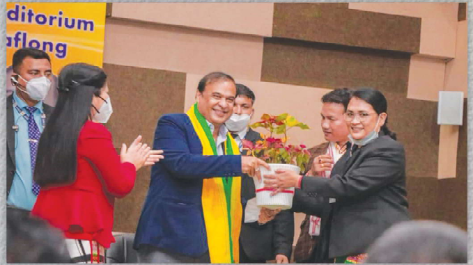
Felicitation of Hon'ble CM of Assam Dr. Himanta Biswa Sarma